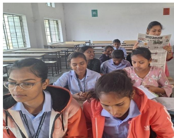
OUR STUDENTS ARE BUSY IN READING THE NEWSPAPE